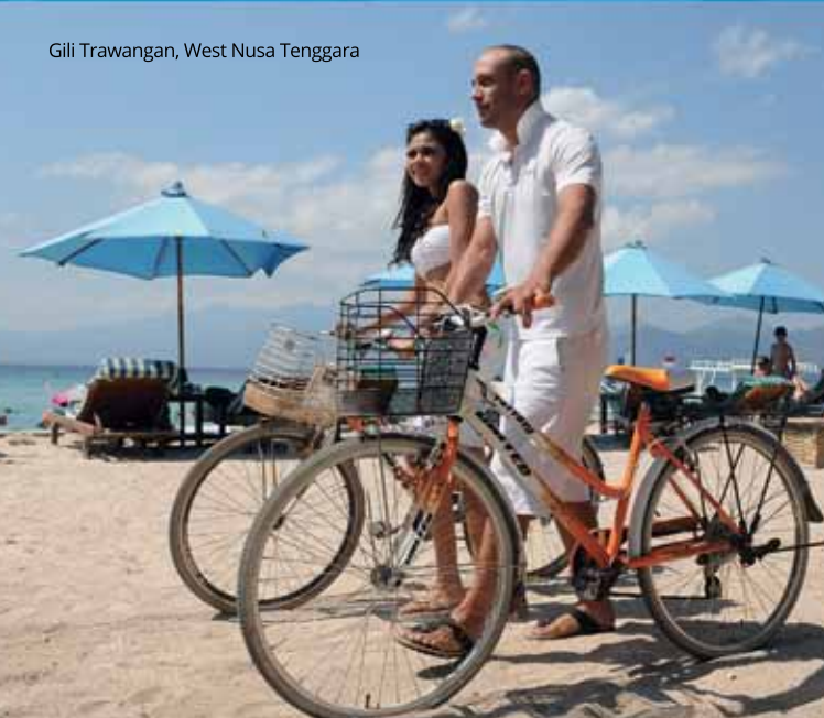
Gili Trawangan, West Nusa Tenggara

Where Adventures Find Unforgettable Beauty MINISTRY OF TOURISM AND CREATIVE ECONOMY REPUBLIC OF INDONESIA