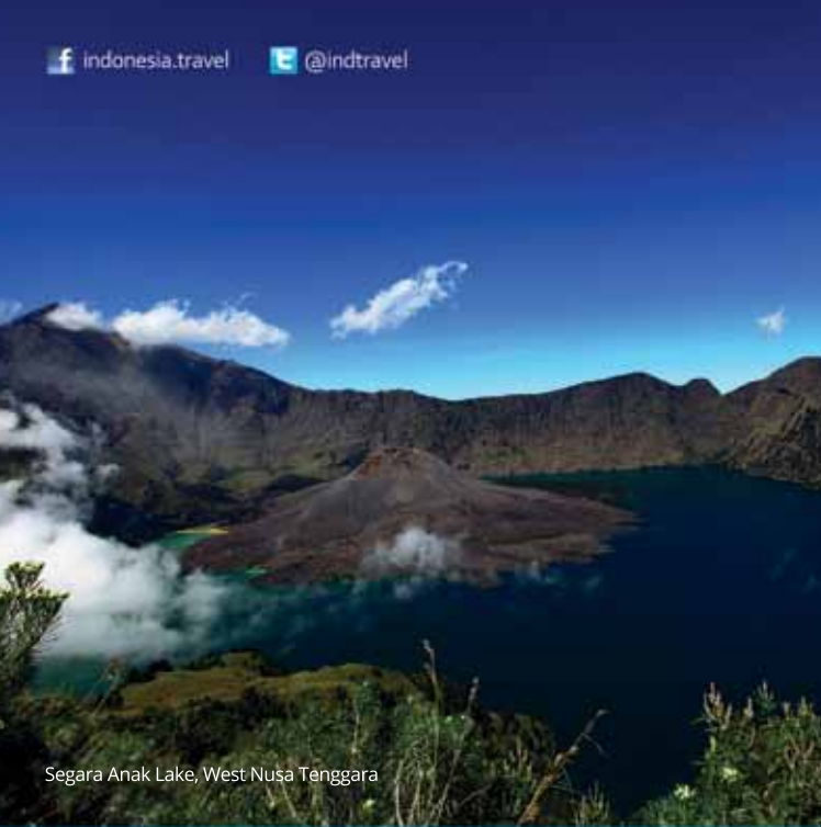
Segara Anak Lake, West Nusa Tenggara

Where Adventures Find Unforgettable Beauty MINISTRY OF TOURISM AND CREATIVE ECONOMY REPUBLIC OF INDONESIA